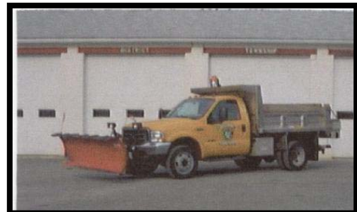
District Township's Newest Workhorse: Ford F550 Stainless Steel Dump and Spreader for Extra Long Life.

2684. Leave your name and number, and I will do my best to call you back with an update. Here is a list of Township roads: Groff, Merkle, Hardt Hill, Weil, Kemp, Lutz, Crag, Bull, Chew, Keim, Treichler, Benfield, Delong, MaryAnn, Dogwood, Stone, Mine, Haas, and Weidner. Please report problems with State roads to 610-929-0766.